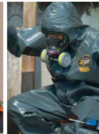
Zytron® 500 gas-tight styles features new AntiFog Visor. (note: old vs. new comparison shows Frontline® garment)