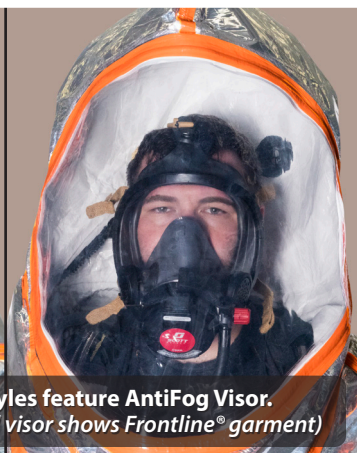
Zytron® 500 gas-tight styles feature AntiFog Visor. (note: comparison vs. standard visor shows Frontline® garment)