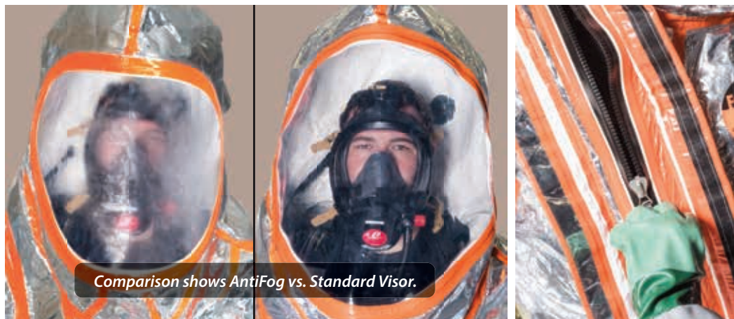
Comparison shows AntiFog vs. Standard Visor.