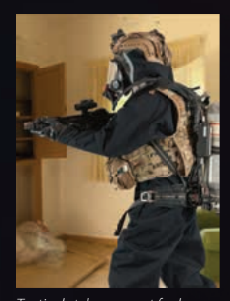
Tactical style garment for law enforcement and military use.