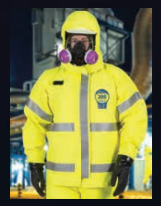
DuraChem 200 is also ideal for industrial work.

Complete technical and chemical test data for the DuraChem line is available at kappler.com.