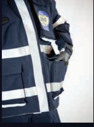
Pockets and equipment loops are popular customizations.