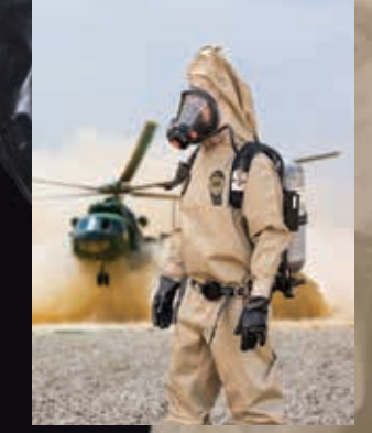
Tan color option is often preferred for Military use.