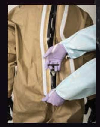
Easy to hold rear zipper aids donning and doffing ergonomics.