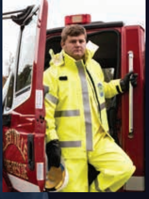
Firefighters can reduce use of expensive turnout gear.