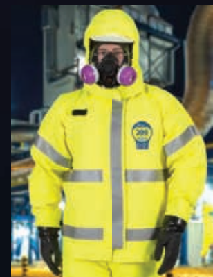
DuraChem 200 is also ideal for industrial work.

D200 - Does not contain PFOA or PFOS Chemistry.