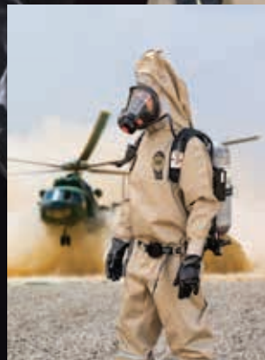
Tan color option is often preferred for Military use.