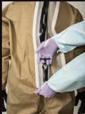
Easy to hold rear zipper aids donning and doffing ergonomics.