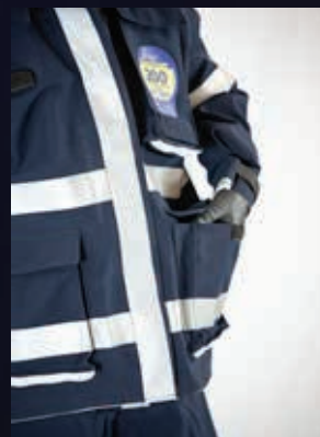
Pockets and equipment loops are popular customizations.