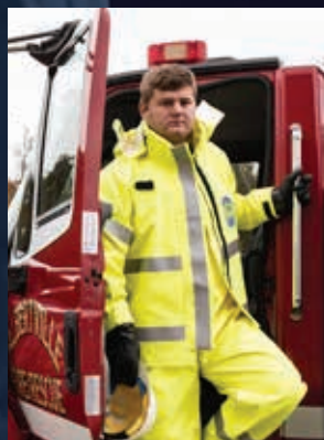
Firefighters can reduce use of expensive turnout gear.