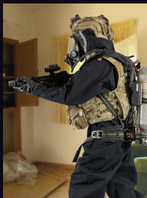
Tactical style garment for law enforcement and military use.