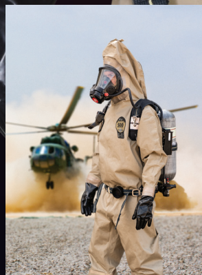
Tan color option is often preferred for Military use.

Complete technical and chemical test data for the DuraChem line is available at kappler.com .